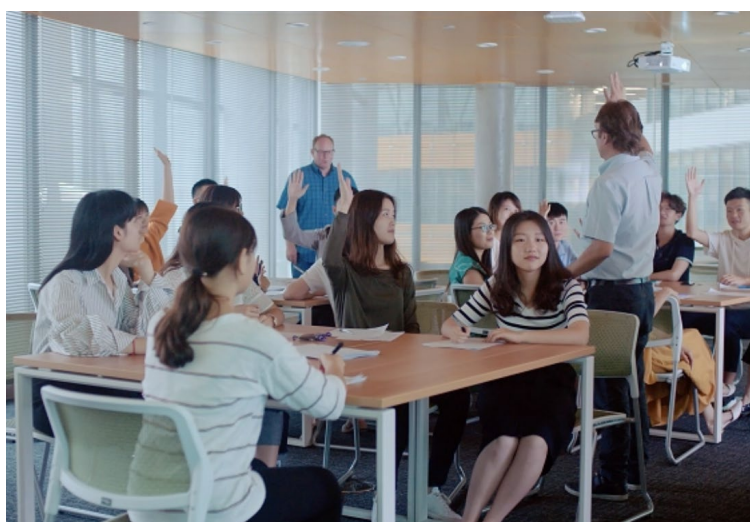
Figure 2 University English situational teaching classroom

In the actual instructional process, English teachers can combine these characteristics of students, adapt the English text content into the performance content of stage play according to the rich English teaching materials, give full play to the principle of openness in university classrooms, and carry out classroom performance activities. Teachers should combine situational teaching with action-oriented teaching, which can comprehensively improve the quality of university English classroom teaching. At the same time, it is conducive to improving university students' comprehensive ability to use English. Multimedia images are vivid, rhythmic and cheerful. Students can not only concentrate their attention on learning, but also free themselves from the monotonous and tense learning environment, stimulate their desire to express their thoughts, arouse their curiosity and improve their learning efficiency. Figure 2 shows the situational teaching class of university English.